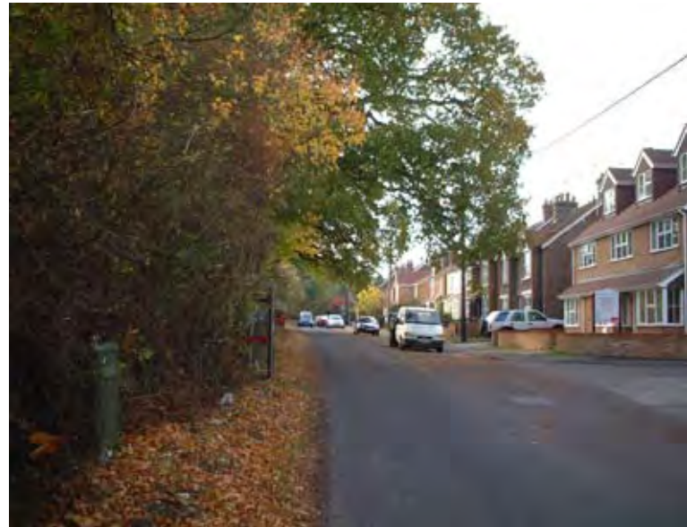
New and old houses on Hayes Lane

South of the Downs Link (towards the A29) Hayes Lane had very little development prior to the 20 th century. Less than a dozen small cottages existed, the majority of them on long, narrow plots enclosed from the roadside wasteland. The brickyard began operating in 1895, on the site now occupied by the Flint Group (formerly BASF). Nos. 1 to 24 Hayes Lane were constructed of local brick in front