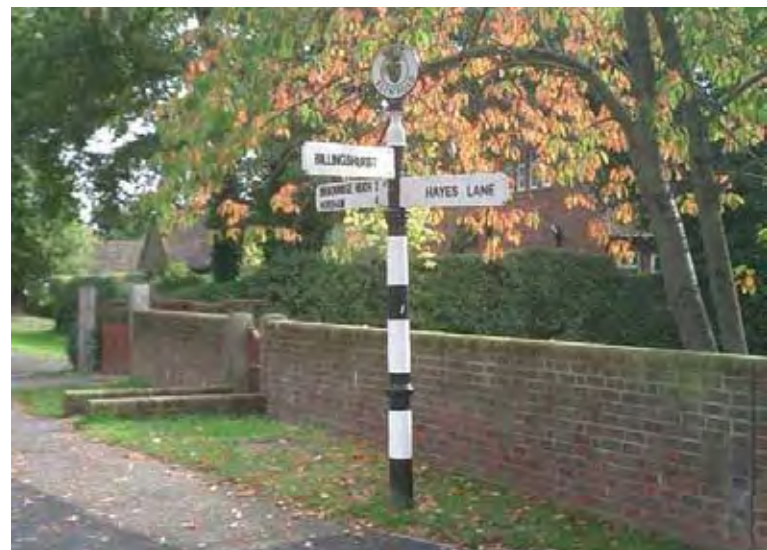
Lyons Road/Hayes Lane Way Marker

Within Slinfold parish there are four public phone boxes, the one in the conservation area is a traditional red phone box, the others are of a modern design.