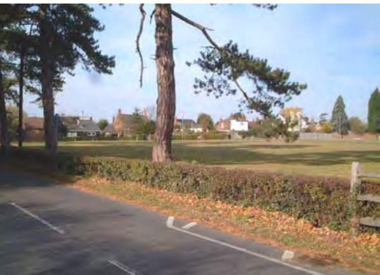
Cricket Pitch from Lyons Road

Lyons Road leads out of the village towards Horsham. It retains its character of a rural lane and acts as an important buffer between Slinfold and Broadbridge Heath/Horsham. There are a few older houses, including a couple of timber-