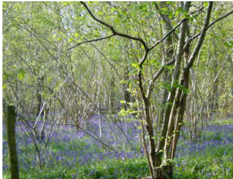
Bluebells at Nowhurst

Geologically , Slinfold lies in the Low Weald area of Sussex, noted for its pastures and