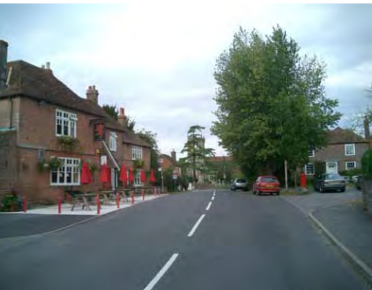
Village Centre - Red Lyon

Between the two world wars there was virtually no development in Slinfold, but during the last half of the 20 th century the village dramatically expanded beyond its original confines, increasing almost ten-fold in size. Hayes Lane now has a number of side roads: Park Road , the Lowfield Green Estate which was begun in 1949, West Way and, more recently, Six Acres . Lyons Road has housing extending as far as The Limes, with Lyons Close and Mitchell Gardens to the south. The development along Park Street was triggered by the sale of Old House Farm in 1953, and a small new estate, Tannery Close , was built on land belonging to Hall Land. Through it all the village's central