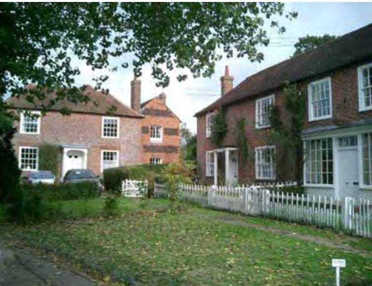
Village Centre - Old Village Green

Within the village, there are few open spaces apart from the central fields, the cricket pitch and Lowfield Green. Slinfold village (as defined by the Built-Up Area Boundary) is basically ‘fully developed’ and could not now take any further significant development without ruining it forever by building on those few remaining spaces that are part of what makes Slinfold what it is today.