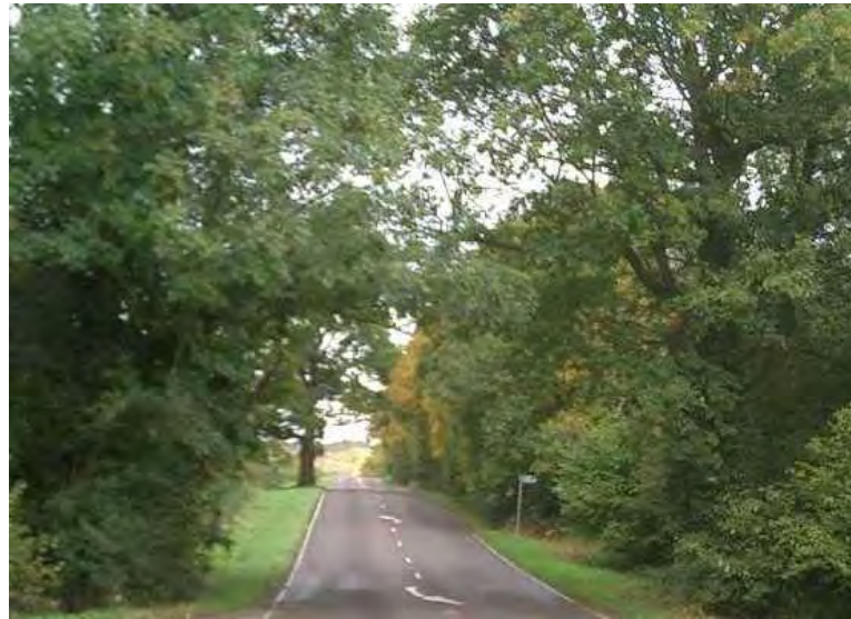
Stane Street from Random Hall

The seeds of Slinfold's development were sown in the fifth and sixth centuries when groups of Saxon settlers on the coast used areas of the