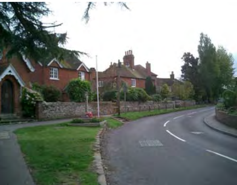
The Street by the Village Hall

Slinfold village centre is one of the most attractive in the Sussex Weald and contains all that is quintessential to a true English village. The church, shop, pub, school, village hall, and houses of different dates, styles and materials