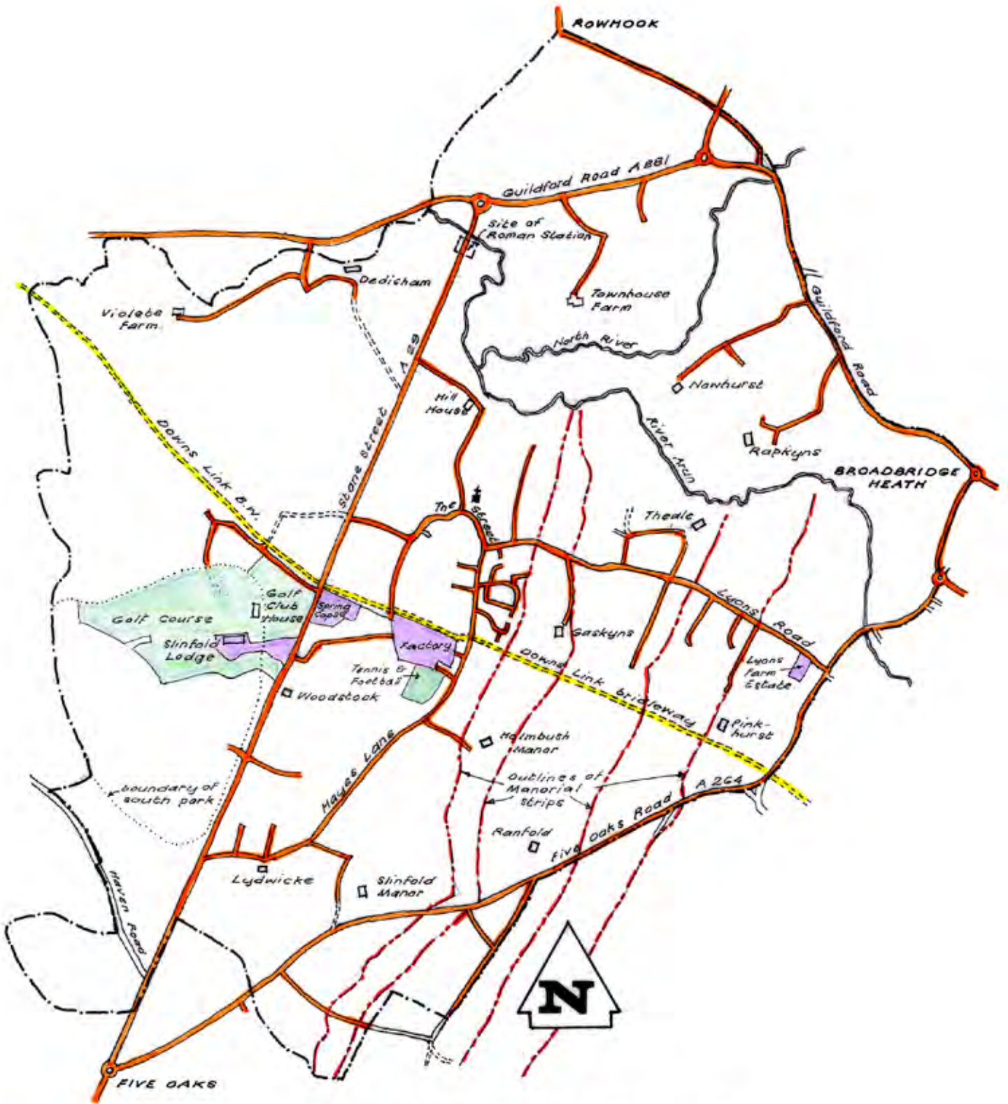
SLINFOLD - Map of Parish