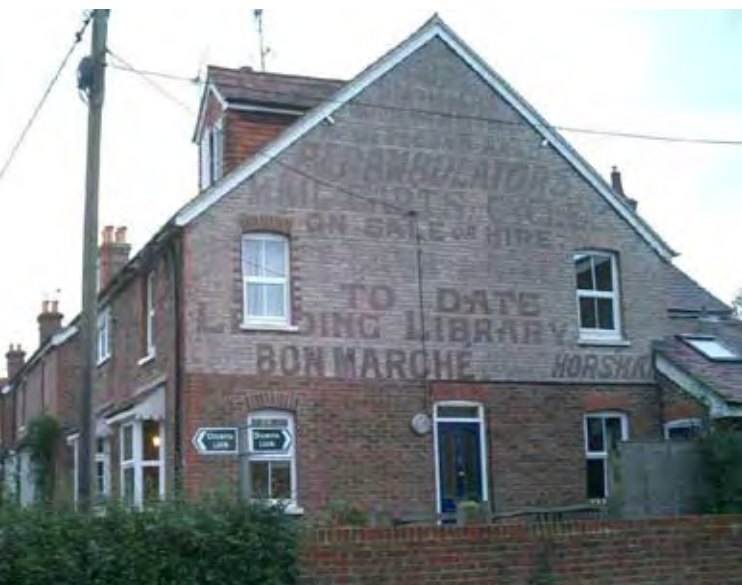
Hayes Lane Downs Link Crossing

In many Wealden areas large tracts of land remained as commonly-held wood pasture, or commons . However, by the time the Slinfold church was built in the 12 th century, there was only a small area of common land left open. Two roads came into this area, the present Park Street from the west and Lyons Road from the east. There was a third track coming from the north, Clapgate Lane . This opened out into a funnel-shaped piece of land, where the church was built.