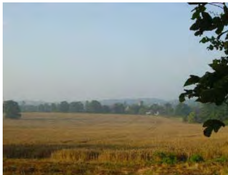
Village from Hill House

The parish of Slinfold is rich in evidence of its past history, and all changes and developments need to take this into account.