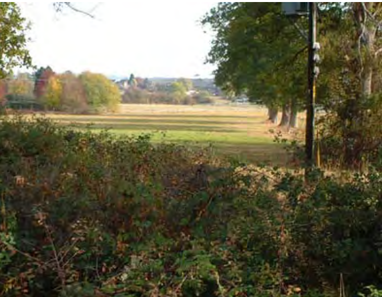
Central Fields from Spring Lane

Slinfold Cricket Club on Lyons Road has been in existence since 1775. The cricket field has a beautiful line of scotch pine trees on its border with Lyons Road and provides open views out of the village to its rear. Its pavilion/club house is a simple corrugated-iron structure built many years ago.