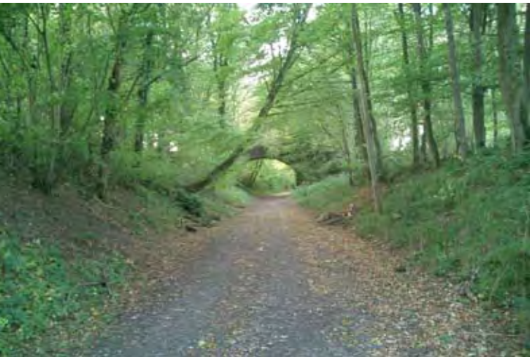
Downs Link near Huntinggrove

The rich heritage of footpaths linking the individual farms with each other and with the church, make for a substantial network of paths and bridleways within the parish. Much use is made of these, however many of the footpaths have unstable old stiles which are difficult for the elderly and those with children or dogs. The underlying Wealden clay and the historical topography of a path being worn through the surrounding land means that most paths become very muddy after a relatively small amount of rain.