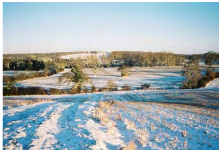
Slinfold Parish from Rowhook

Around the A281 from Clemsfold to Roman Gate is an area of unspoilt farmland traversed by the Arun and North River. To the west of the Clemsfold roundabout is a group of mixed residential and business buildings, including a nursing home, a garage and a woodyard. There are a few individual houses set well back from the road, especially in Townhouse Copse