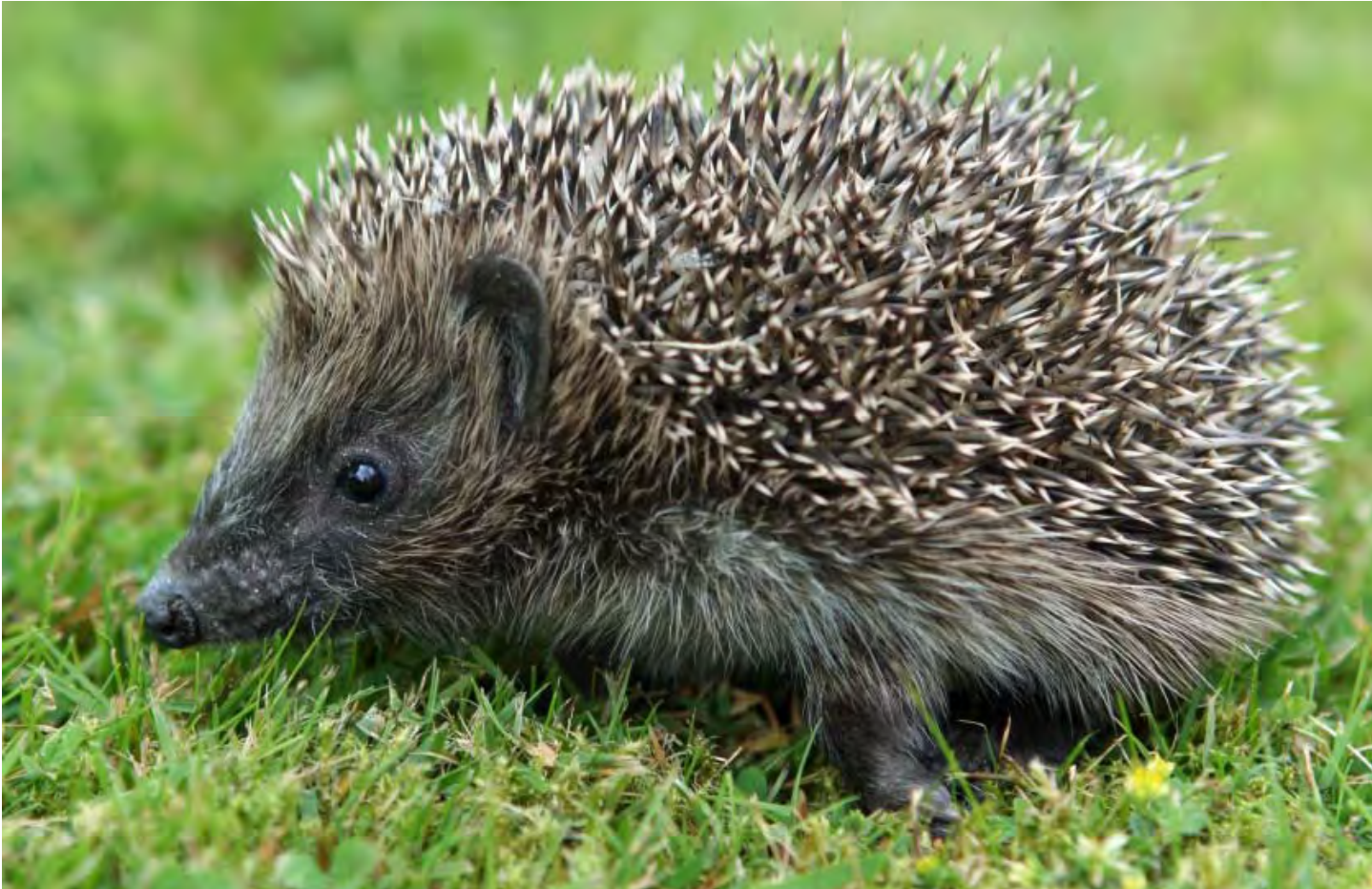
Hedgehog in Garden

Many gardens have brightly coloured finches, tits, blackbirds, thrushes, and robins. In the fields, woods, and hedgerows there are pheasants, woodpeckers, herons, sparrow-hawks and kestrels. At dusk the Pipistrelle bats forage the numerous species of moths and insects, whilst little owls and barn owls hunt for larger prey out across the countryside.